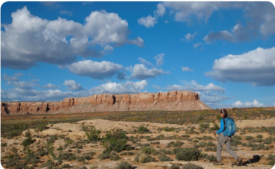
Near the mouth of Butler Wash

Total on-foot distance for all the Comb Ridge canyon hikes described here (including Wolfman Panel) is 17 mi (27 km). Total elevation gain: 2298 ft (700 m). Ideally, allow two days and camp in Butler Wash. If your soul is going to mingle with primordial ghosts, it'll happen at night, beneath the stars, when Comb Ridge is bathed in moonlight.