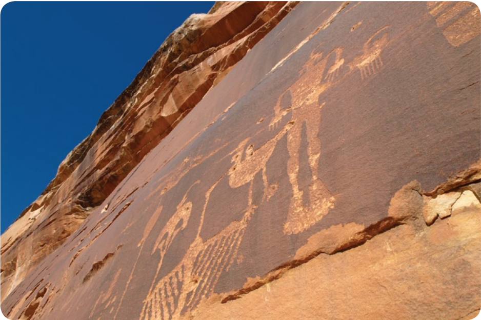
Wolfman Panel, Butler Wash

When you leave, initially vary your descent by staying left, high, along the base of the cliff. Close observation of the walls will reveal many more petroglyphs. Soon drop right and return the way you came.