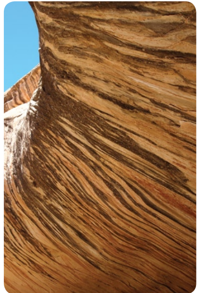
Alcove near Double Stack Ruin

From the slickrock bench, follow the tiny drainage west. Soon reach the canyon rim at 4435 ft (1352 m). Butler Wash is visible below. Cairns indicate the descent route. Go left (south-southwest) on the ledge. Immediately past the small alcove, look left (east), above you. The Wolfman Panel is on the west-facing wall, at 4362 ft (1330 m), 15 minutes from the upper parking area. On the return, after ascending to the slickrock bench, go left (northeast) a couple minutes along the canyon rim. Look left (north) to see a couple ruins on the far canyon wall.