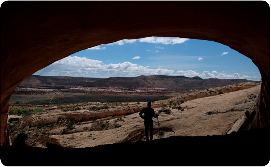
Fish Mouth Cave