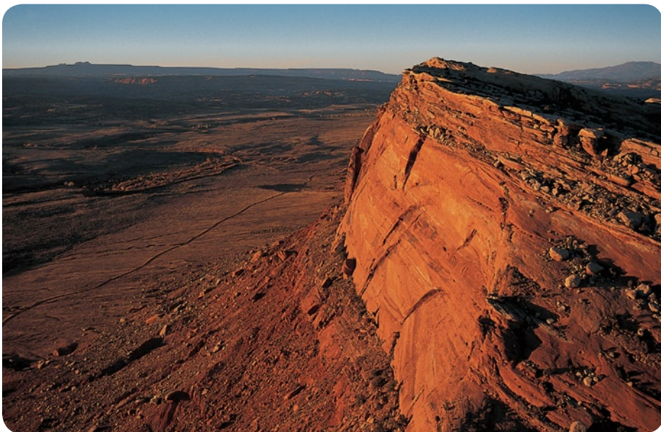
Comb Ridge, from Procession Panel

Lodged in the teeth like poppy seeds are numerous, ancient ruins and rock-art panels, because Ancestral Puebloans lived here until about 700 years ago.