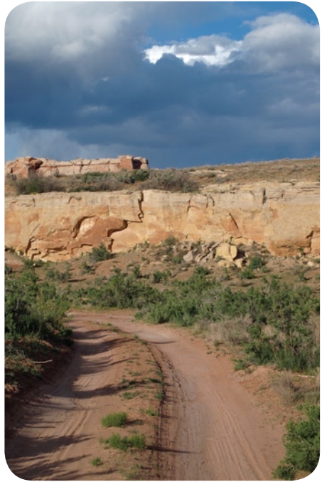
Road 262 along Butler Wash

Immediately before a fence and cattleguard is a left fork leading northwest to Wolfman Panel trailhead . In 137 yd (125 m) reach the first parking area at 4477 ft (1365 m). The spur, rougher now, continues 75 yd/m farther, descending to a broad, slickrock bench.